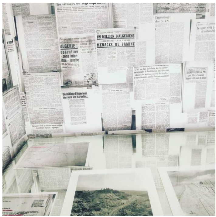
Figure 8. Photograph of one of the exhibits at the 'Discreet Violence' exhibition.

The placement of documents and photographs on to walls and material surfaces in the building were amplified through the creative use of glass and reflective surfaces. The liquid quality of fragments of building and written text corresponded with the fluid movement of the footage used in 17.10.61. When looking down at exhibits such as photographs of groups of Algerian camp inmates (see Fig. 8), the mirror reflection of the newspaper headlines added an extra visual layer to the objects on display, demanding a more concentrated engagement on behalf of the spectator. This visual disruption was further exacerbated by the sense of continual oscillation between the present-day Parisian exhibition space and images of colonised Algeria. Henni's use of six continually looping television screens, showing early televised recordings taken in settlement camps or building sites, played a particularly effective role in distorting any sense of fixed time or place. Through its re-purposing of space and cultural artefacts, its seamlessly fluid movements from Paris to Algeria and back again, this exhibition provided a nuanced creative response to the absence of state-sanctioned memorials or commemoration of France's colonial activity. Indeed, Alan Rice has argued that memorials created outside the boundaries of official state cultural agendas can invoke 'a complete rewriting of the imperial cityscape' in ways that are multivalent and multifarious.<sup>59</sup> He suggests that