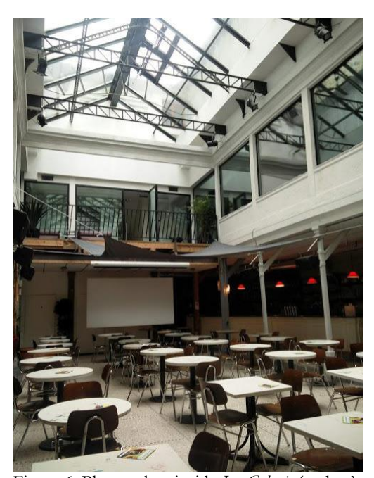
Figure 6. Photo taken inside La Colonie.