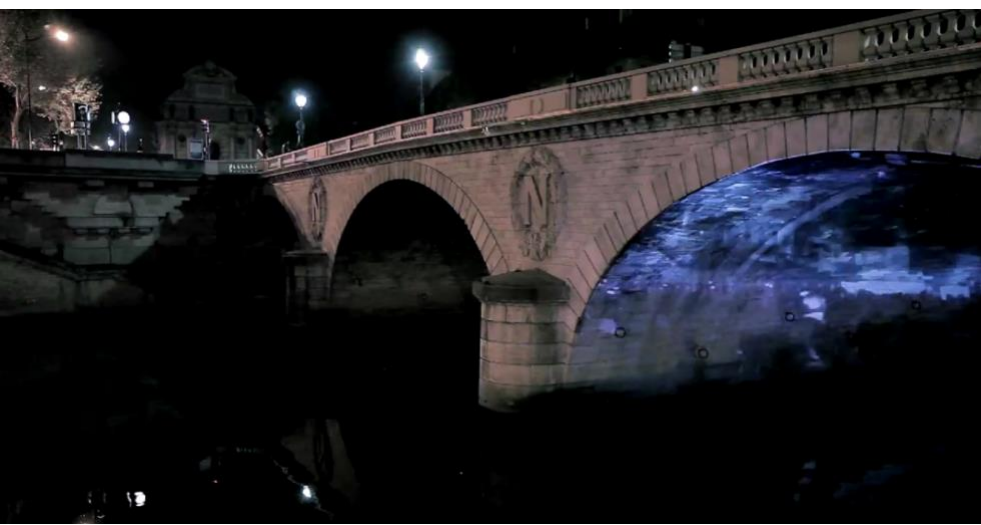
Figure 3. Footage taken from Mohammed's account in 17.10.61.

Through the use of fictional protagonists (represented in the form of ghostly faces as holograms suspended above the bright red outline of the Seine), 17.10.61 mirrors Hirsch's vision of layers and textures, which are presented like folds of skin or veins. The project's sustained emphasis on surfaces and depth serve as a visual reminder of the project of memory's multi-dimensional quality, of the ways in which it is inscribed into space. Furthermore, the group's use of site-specific installations included in many of the testimonies available on the web documentary, underlines the material and tangible quality of much of their work. By including projections of archive footage and images of collective members painting graffiti on the Pont St Germain, Pont Neuilly and the Pont St Michel in the week prior to the fiftieth anniversary, 17.10.61 creates a double-inscription of the events in digital and urban space.<sup>39</sup> This process, in turn, acts as a reminder of the varied and multifarious ways in which memory can live and be represented within the city.<sup>40</sup> In an interview for Poisson Ronge , anonymous representatives from Raspouteam commented: 'Paris s'invente une histoire officielle bien propre sur elle. Pour nous Paris c'est un lieu de luttes, de révolutions, de grandes répressions... Un lieu qui a un sens politique. C'est cet héritage qu'on cherche à inscrire dans l'espace public.<sup>41</sup>