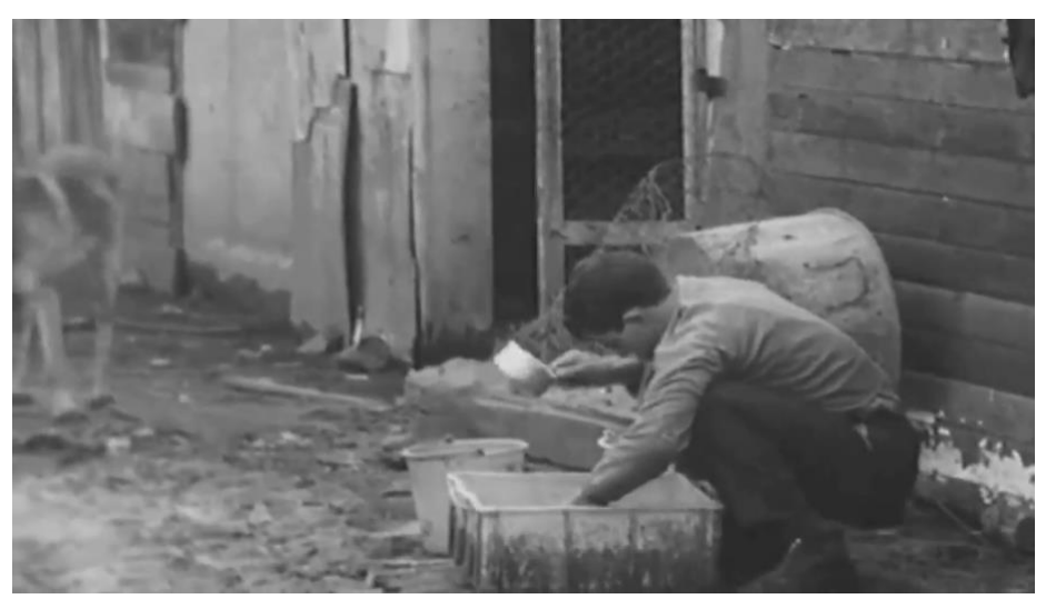
Figure 4. Archival photo of Nanterre featured in 'Salah's' testimony in 17.10.61.

In 'Figures de l'immigré à Nanterre: d'un habitat stigmatisé à l'autre', Anne Steiner makes reference to the 'éradication progressive des bidonvilles, suivie du relogement de leurs habitants' which took place throughout the 1980s. <sup>47</sup> Although keen to highlight the social fractures that the bidonvilles