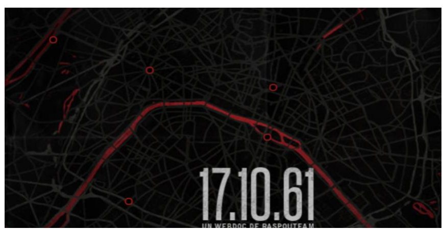
Figure 1. Screenshot from the homepage of the 17.10.61 web documentary.

Positioned at an interface between online and physical space, 17.10.61 provides an important example of how memories are being creatively re-worked in the urban space through the use of smartphone technology. Between the 1st and the 17th of October 2011, the underground street-art collective Raspouteam developed a multi-platform installation and online web documentary to mark the fiftieth anniversary of the 1961 massacre.<sup>38</sup>