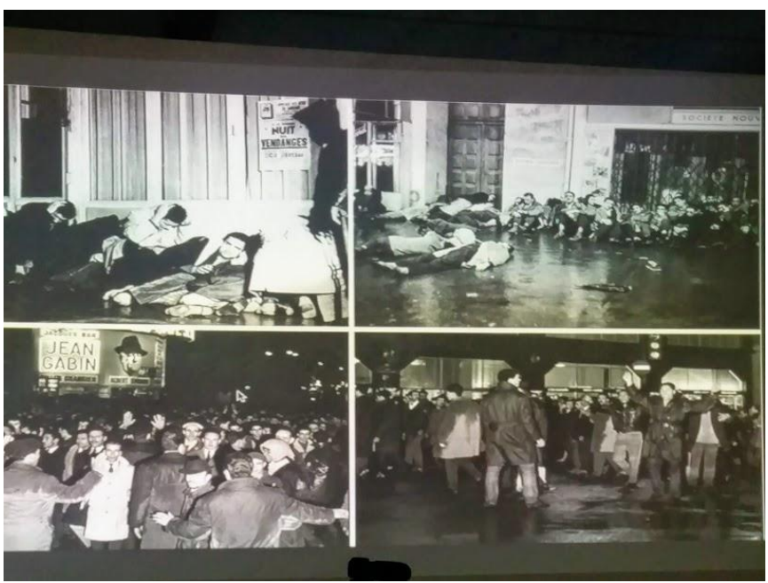
Figure 7. Picture taken of a PowerPoint presentation shown at the opening of the 'Discreet Violence' exhibition at La Colonie , 19 June 2018.

To mark the start of the exhibition, Attia and curator Samia Henni projected images of Algerian protesters and armed police officers onto the wall at various points in the discussion, which the audience were invited to view on the floor above to view the main part of the exhibition. Set against a black backdrop and magnified well beyond their original size, their visual impact mirroring the multi-sensory, visceral quality of the 17.10.6. They remained present throughout: a reminder of their absence from so much of Paris's material space and cultural imagination. As the main exhibition panel stated: 'L'exposition dévoile les relations intrinsèques entre l'architecture, les mesures militaires, les politiques coloniales et la production et la distribution planifiées d'enregistrements visuels.'58